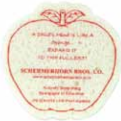
After dipping in water