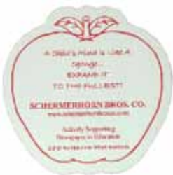
Before dipping in water